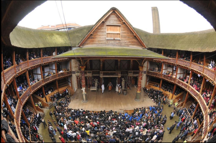
Above: Picture of the modern reproduction Globe Theatre. Right: Layout of original Globe Theatre.