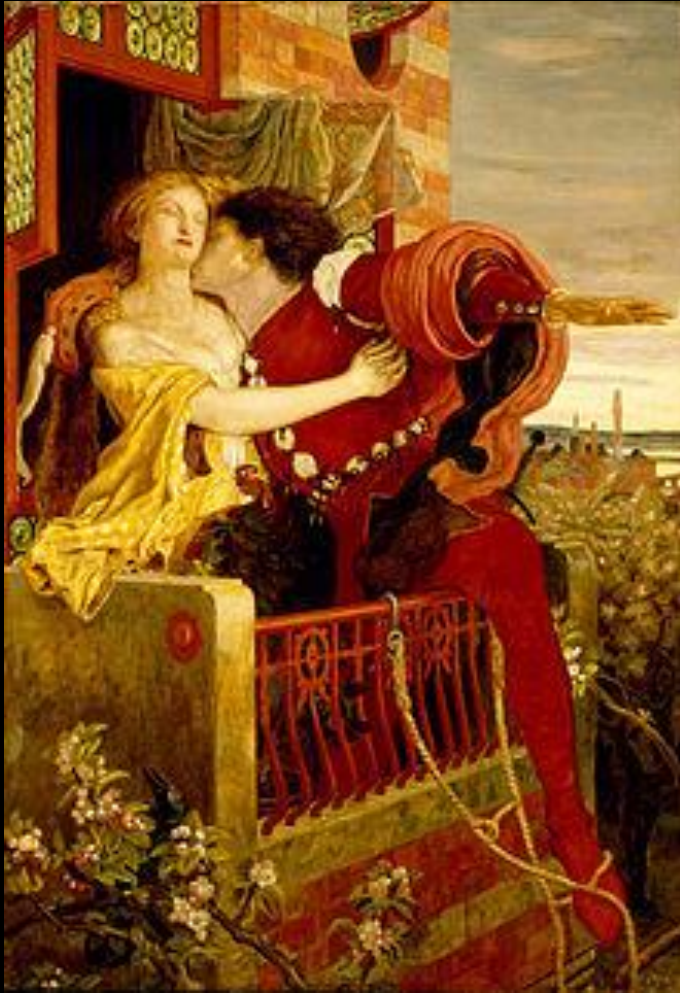
Romeo and Juliet , Ford Madox Brown, 1870.