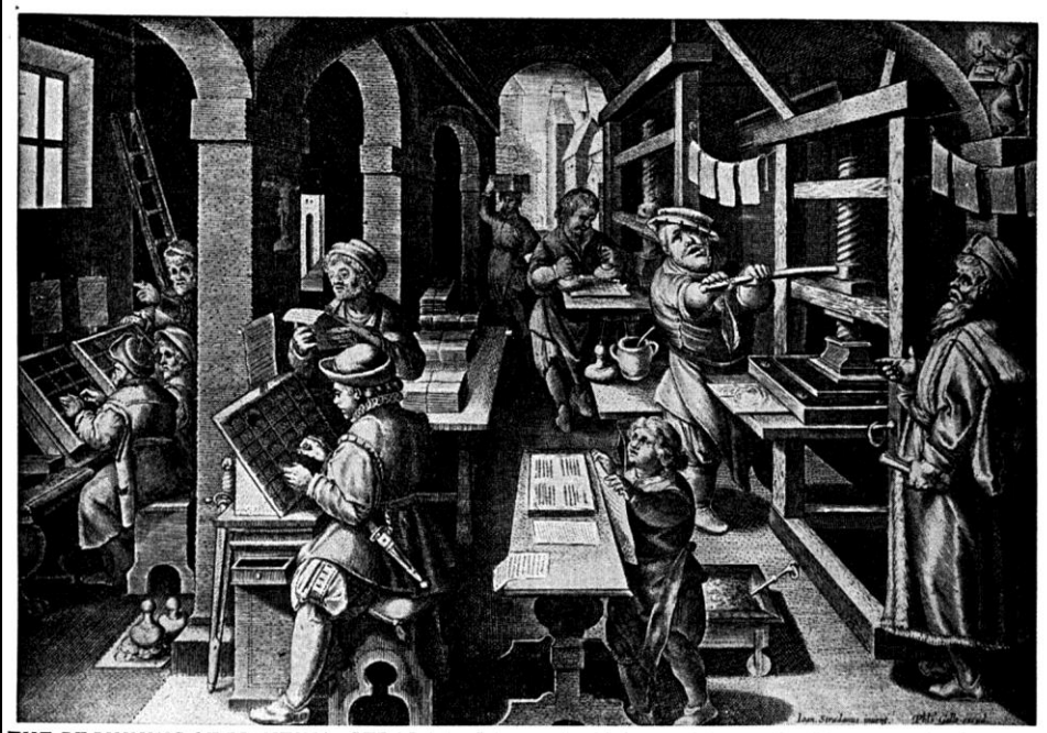
Early etching of an Elizabethan printing press and studio.